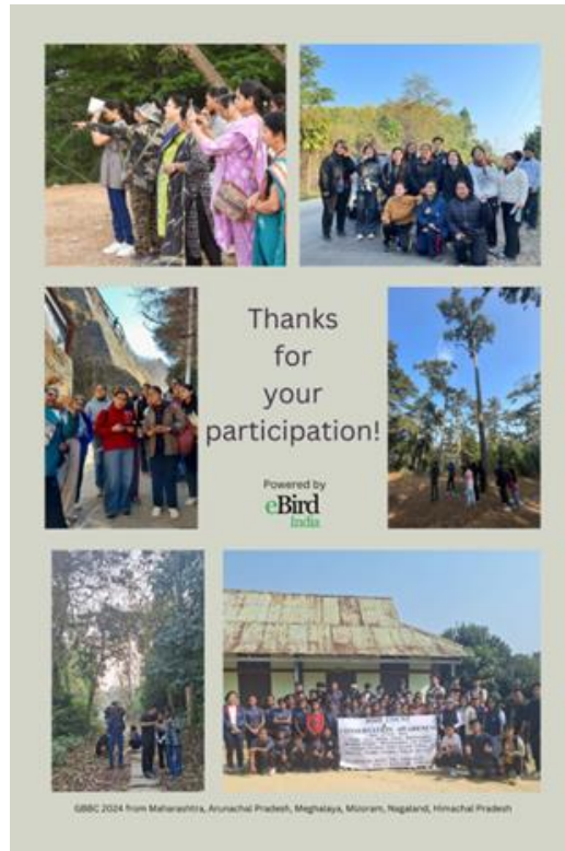
Team RKMV in Bird Count India Poster