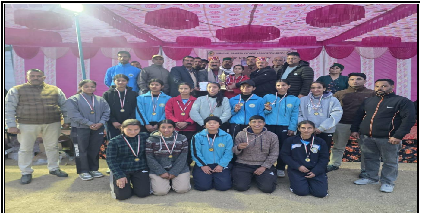
2nd Runners up at HP Senior State Kho-Kho Championship 2025-26

9. Distt Shimla bagged 2nd Runners up at HP Senior State Kho-Kho Championship 2025-26 where 12 girls of RKMV College participated in Distt Shimla Team.