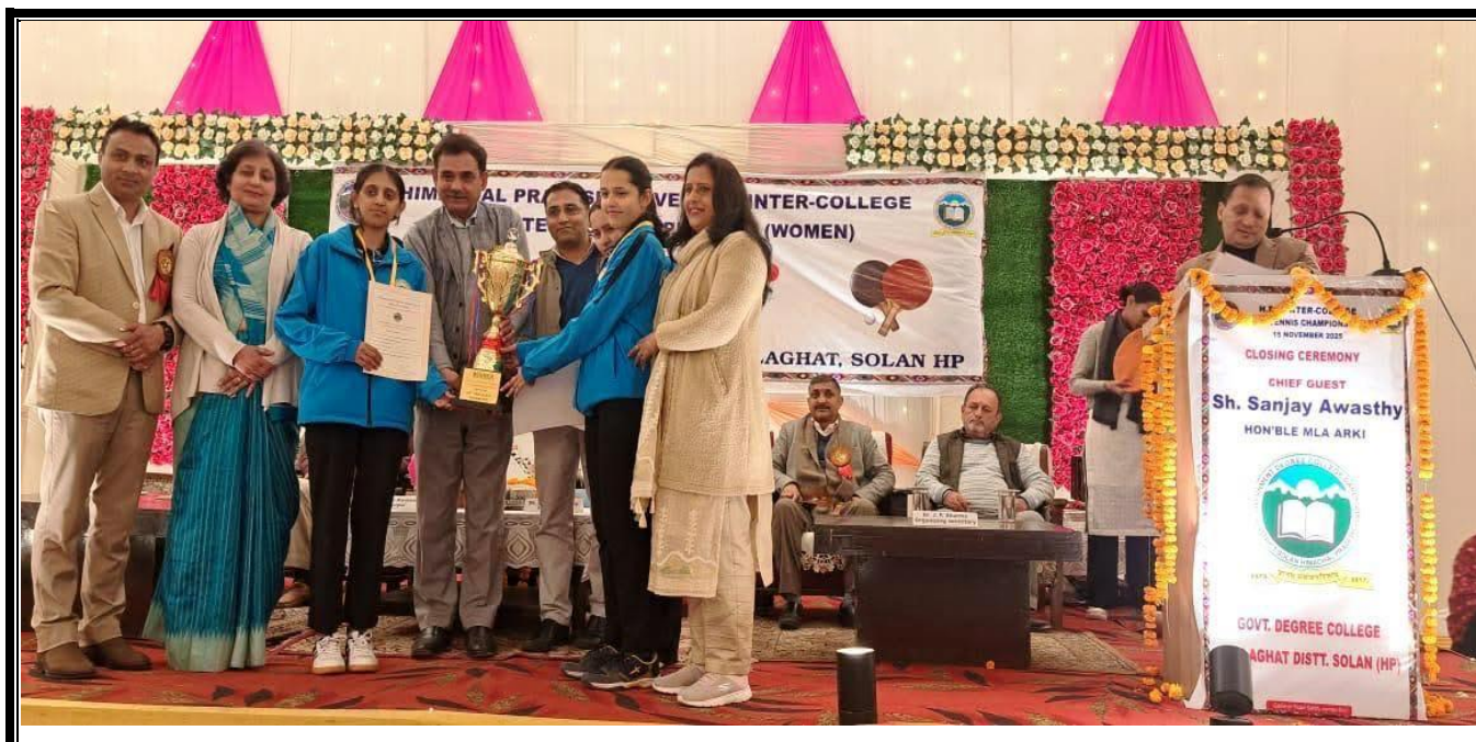
HPU Inter College Table Tennis Championship Overall Winner Champion Trophy 2025-26 RKMV Shimla