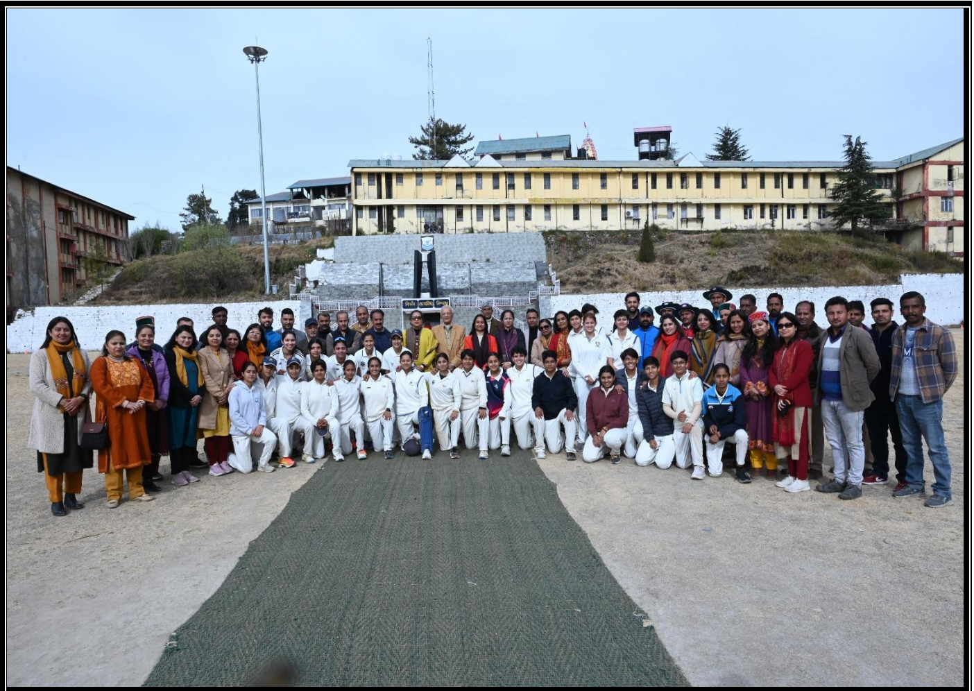
R.K.M.V conducted HPU Inter College Cricket (Women) Championship 2025-26

10. In this year R.K.M.V also conducted HPU Inter College Cricket (Women) Championship w.e.f 15th to 18th December 2026.