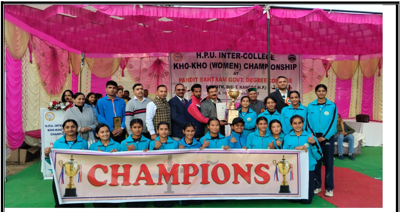
HPU Inter College Kho-Kho Championship Overall Winner Champion Trophy 2025-26 RKMV Shimla

9. Distt Shimla bagged 2nd Runners up at HP Senior State Kho-Kho Championship 2025-26 where 12 girls of RKMV College participated in Distt Shimla Team.