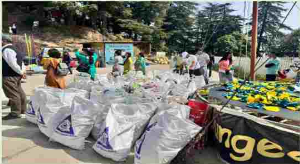
Approximately 1.5 tons of garbage from the small hill was collected