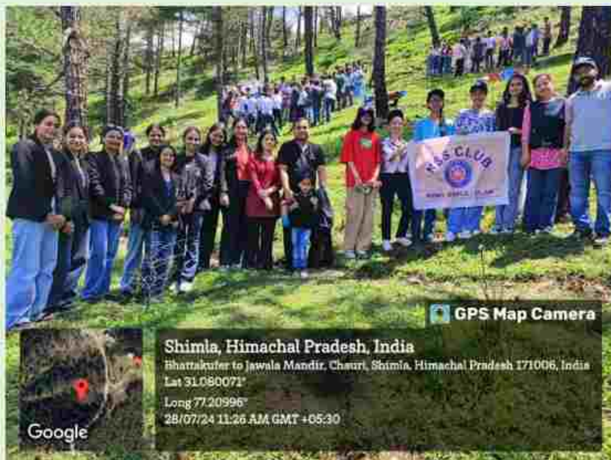
Students and wardens of the Samik & Tribal Hostel participated in Tree plantation drive on the occasion of 'Independence Day' at Rastrapati Bhawan, Mashobra, Shimla