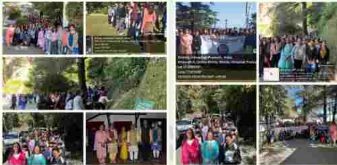
Cleanliness drive and a Visit to Raj Bhawan (YRC)