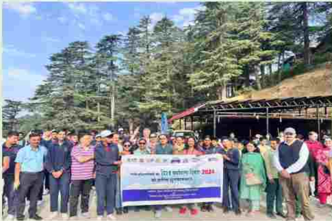
Cleanliness drive organized by the NSS volunteers in the forest area near Ragyan Village