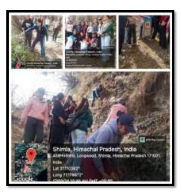
Cleanliness Drive & Rally on 'Nasha Mukat Bharat'