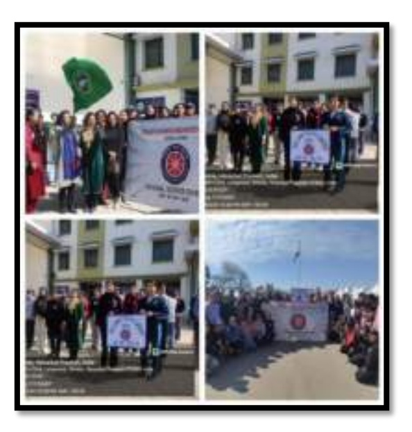
Rally & Nukkad Natak on 'Nasha Mukat Bharat' on the Ridge Maidan